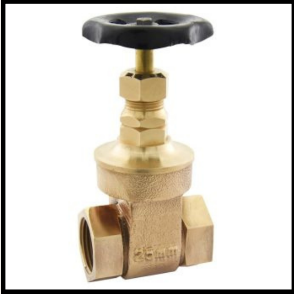
Bronze Gate Valve Threaded NPT / BSPT / BSP