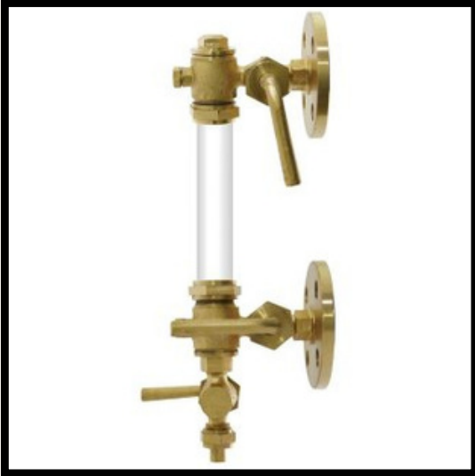
Bronze Gland Packed Water Level Gauge Glass Flanged Ends