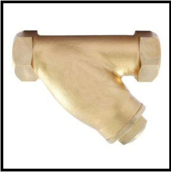
Bronze Y Type Strainer Threaded NPT / BSPT / BSP