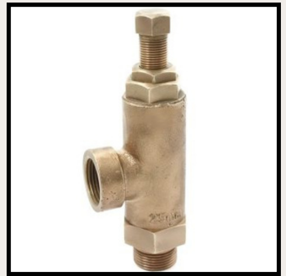
Bronze Pressure Relief Valve (Safety Valve) Enclosed Discharge Screwed Ends