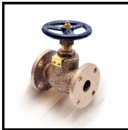
Bronze Marine Globe Valve JIS 5K