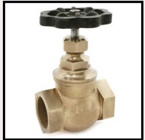
Bronze Globe Valve Threaded NPT / BSPT / BSP