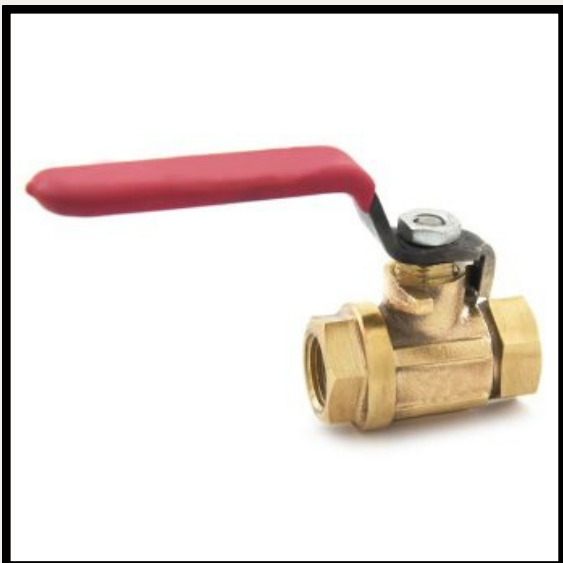
Bronze Ball Valve Threaded NPT / BSPT / BSP