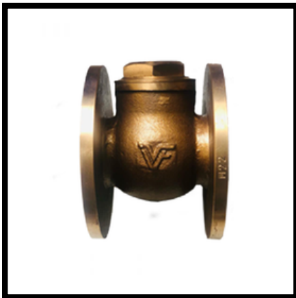
Bronze Swing Check Valve PN-16 Flanged End UNDRILLED