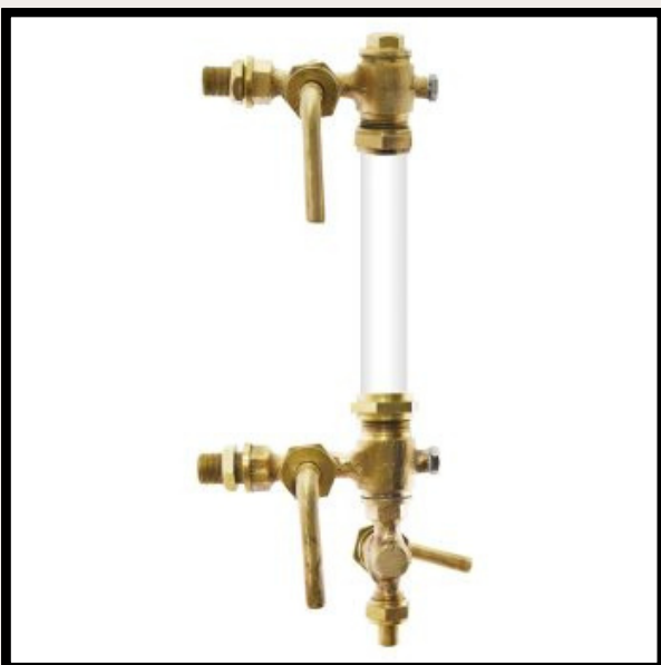
Bronze Gland Packed Water Level Gauge Glass Screwed Ends